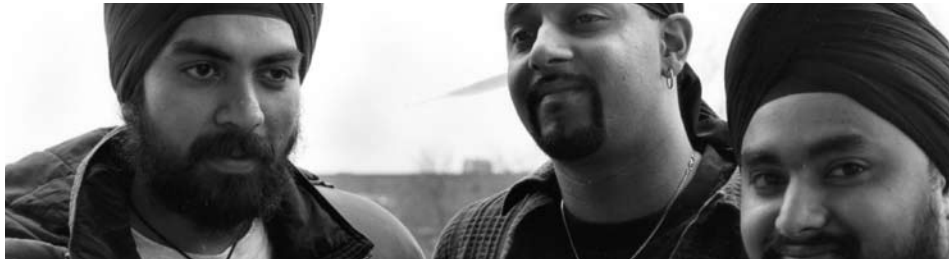
Desi Remix Chicago Style