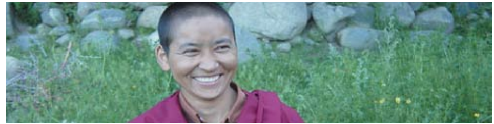
The Sisters of Ladakh