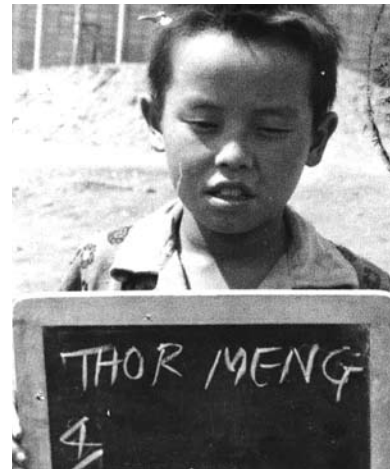
Borne in War