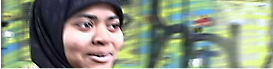
Bangla East Side