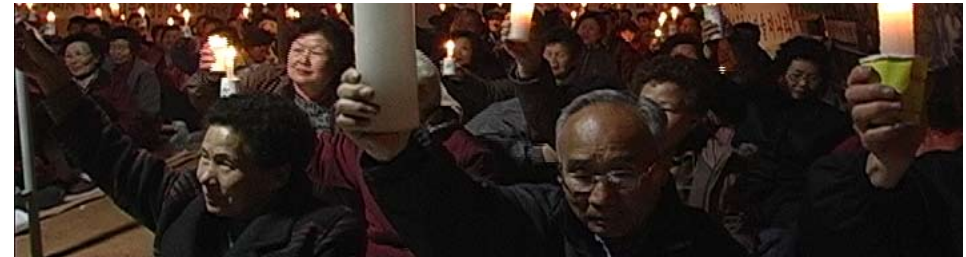
War in Daechuri