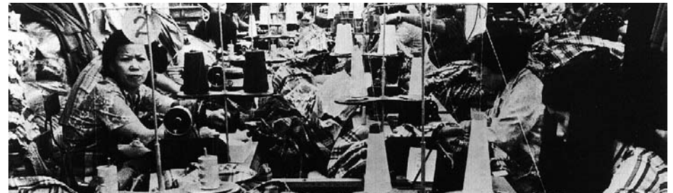
From Spike to Spindle

Edward Wong 1999, 26 min A personal documentary essay about two men who took part in the violent socialist struggles of the mid-20th century, only to face resistance and disillusionment. Video Rental: $50/Video Sale: $175