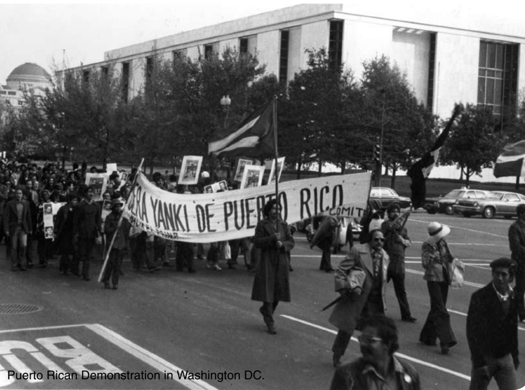
Puerto Rican Demonstration in Washington DC.

Latino communities were fractured by policies of neglect and marginalization. Community programs were established to provide food, clothing and health services in their communities.