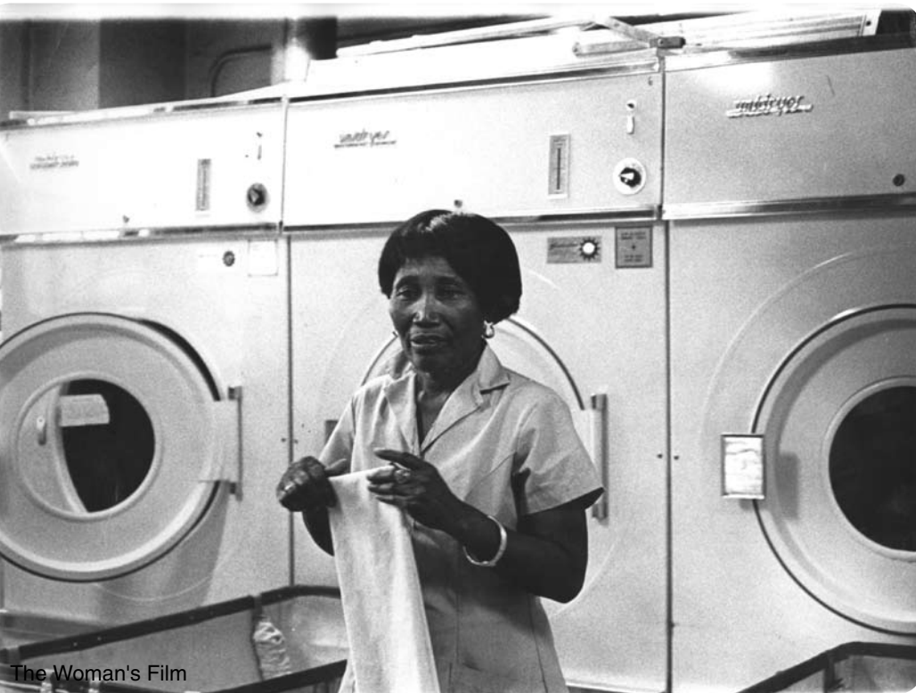
The Woman's Film

Feminist activists in the 1960s passionately resisted the objectification and disparagement of women. Feminists linked the economic and sexual exploitation of women and defied sexism, misogyny, and patriarchal culture.