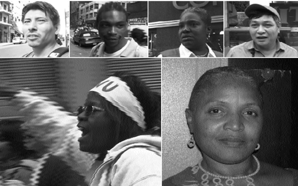
top: Voices in the Street , bottom left: Respect , bottom right: Walking with FUREE